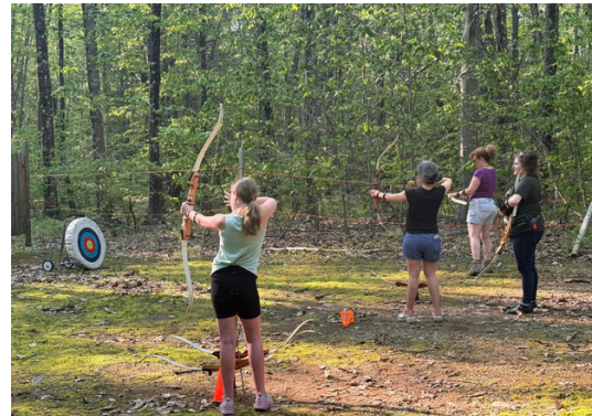
● Celebrating Lag BaOmer at Camp Seawood